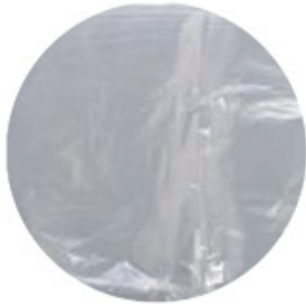
Post-industrial waste of polyethylene is collected 回收工业边角料