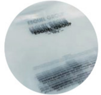
Recycled LDPE polybag 再生低密度聚乙烯塑料袋