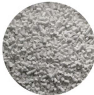
Anti-mold substance 混入防霉母粒