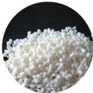
PE / PP / PO etc. 再生/非再生塑料袋原材料

The principle of anti-mold action of garments 成衣防霉作用原理: